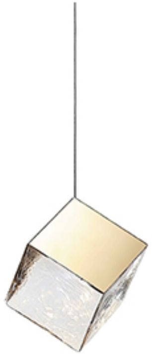
Ref Pic SCALE: NTS